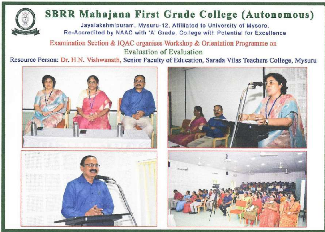
Controller of Examination SBRR Mahajana First Grade College (Autonomous) Jayalakshmpuram, Mysuru-570 012