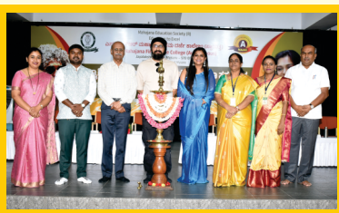
Inauguration of Student Parliament & Talent Forum