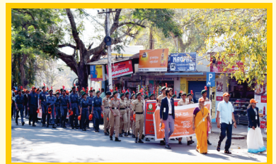
Cancer Awareness Programme