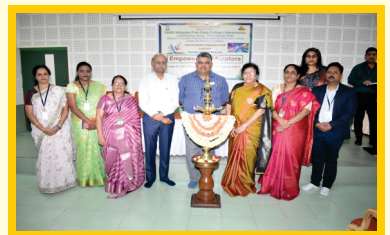
Training Programme on Empowering Educators