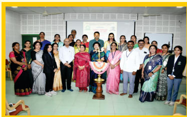
National Science Day - 2025