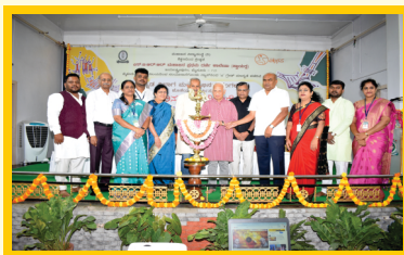
International Seminar-Dept.of Kannada