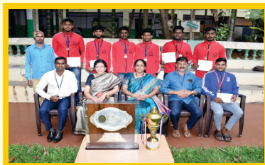
MUICT - Wrestling Overall Championship