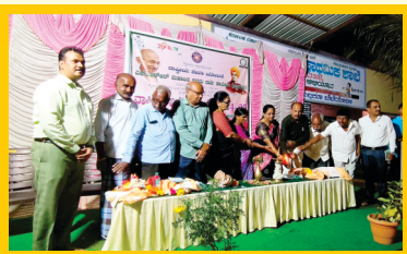
NSS Annual Special Camp - 2024-25